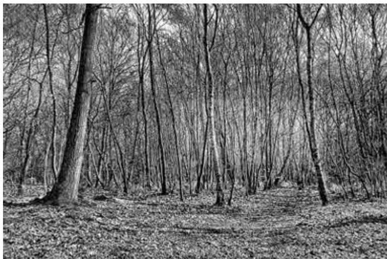
Mousehold Heath January 2009